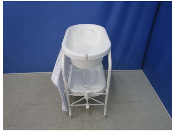
Sample A as received