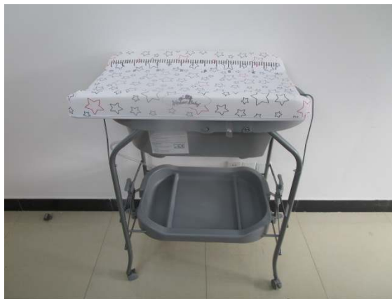
Sample B as received