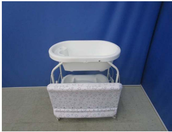
Sample A as received