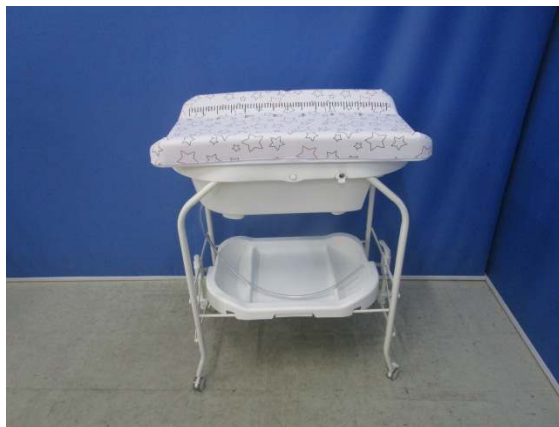
Sample A as received