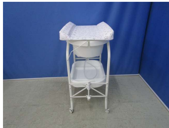
Sample A as received